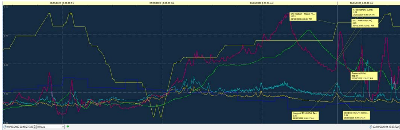
TG Inbye Sensor 8hr trends