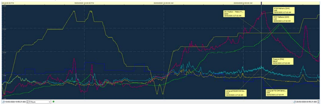
TG Inbye Sensor 8hr trends